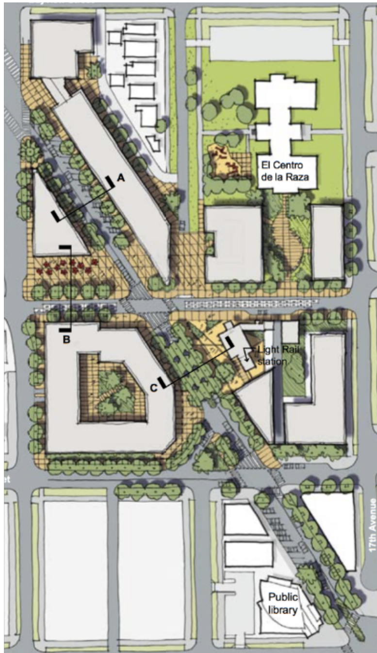
High Level Concept plan from the North Beacon Hill Town Center Urban Design Framework

We urge you to support including $150,000 in funding for Beacon Hill Town Center Safety Planning in the 2017 budget.